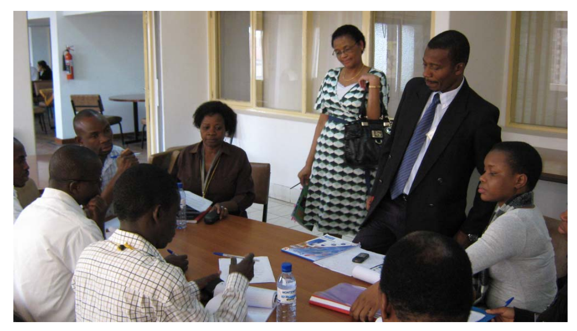
Group discussions on follow up

The groups reported in their proposals in the plenary, as outlined below: