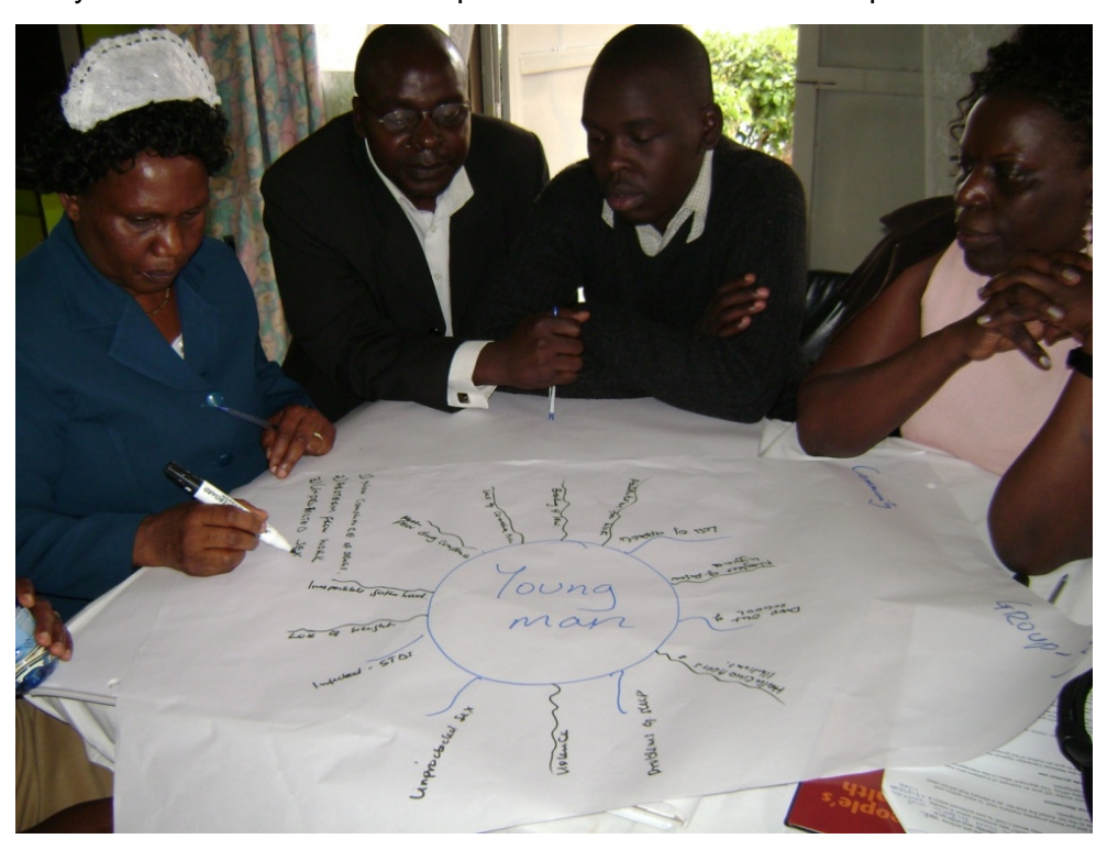
Health workers and community members discuss the problems a young man living with HIV faces if he abuses alcohol.

Each group then used beans to rank and score the top three problems that they felt were most important for PLWHA, and again those that were most important for the health workers.